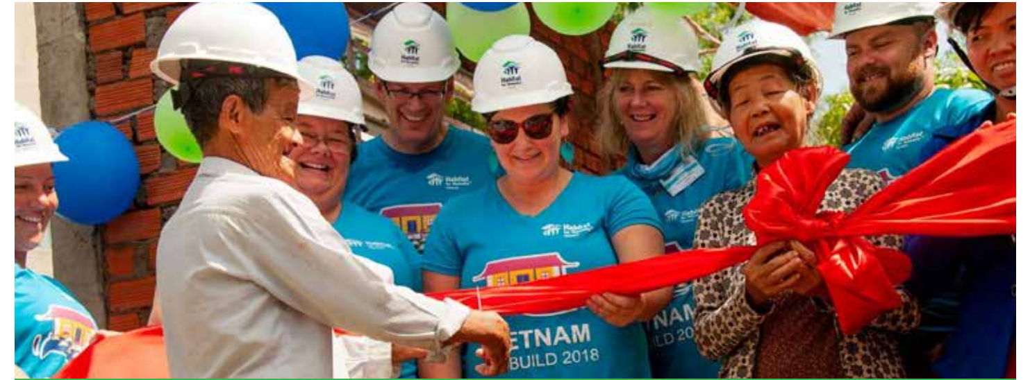
Family cutting the ribbon

The Global Village Trip program is a way volunteers can travel to communities around the world and help build safe and stable housing for families in need. The journey is not only uplifting a family and local community, but it's a humbling and life changing experience for the volunteers.