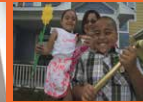
150 hours of sweat equity = homeowners!