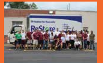
ReStore Home Improvement and Donation Center