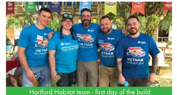
Hartford Habitat team - first day of the build