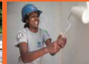
A Brush with Kindness