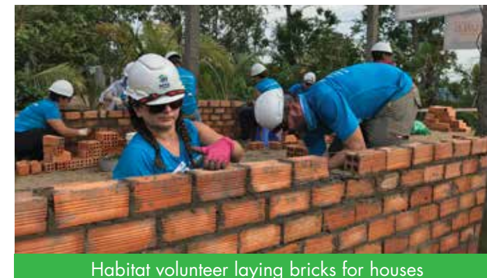
Habitat volunteer laying bricks for houses

In November 2019 Hartford Habitat will be going to Homa Bay, Kenya to complete a Global Village Build. To donate to this build, contact April Hansley for details and/or visit www.hartfordhabitat.org/support .